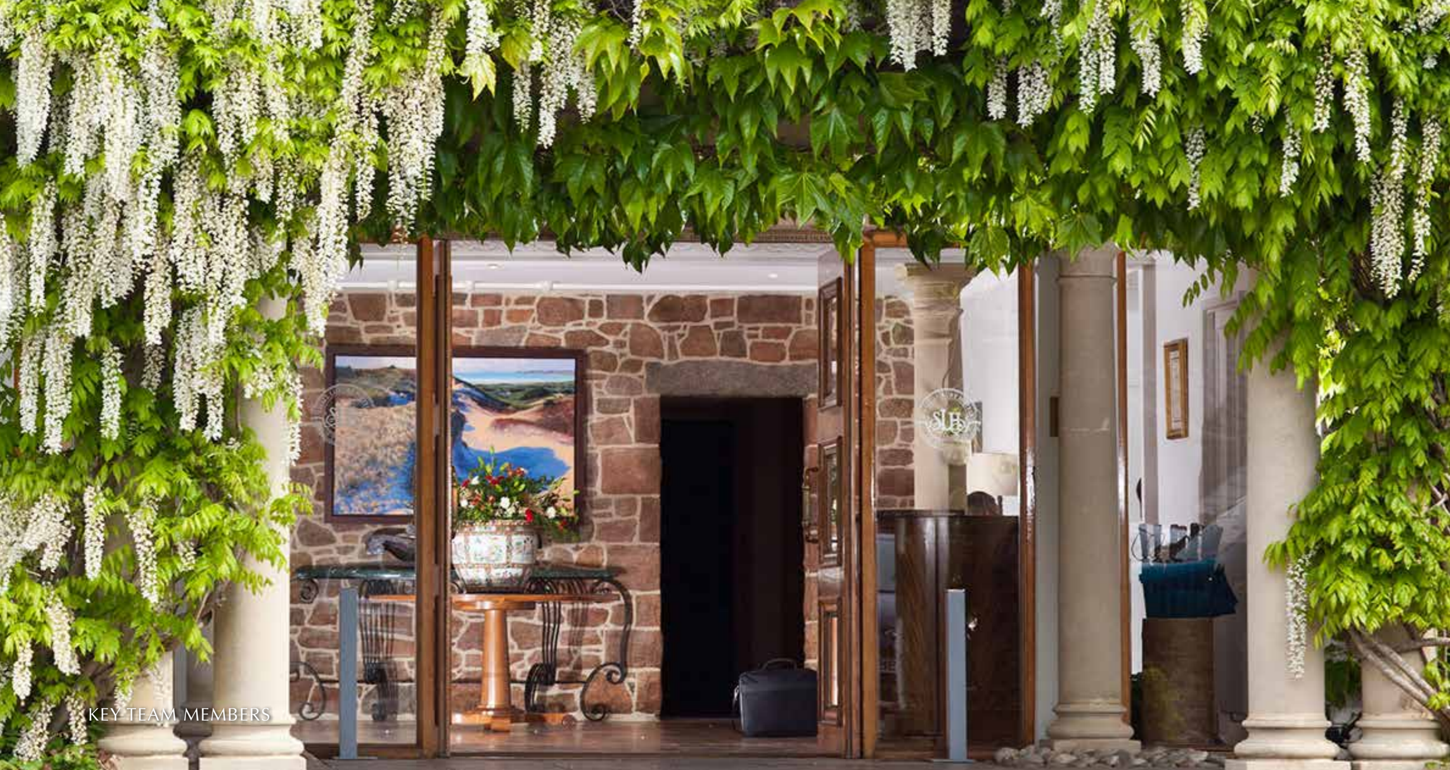
KEY TEAM MEMBERS